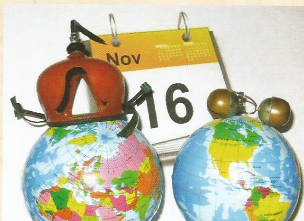
On November 16th, falconry bells will sound in every corner of the world

It is interesting to concentrate actions on a common platform.