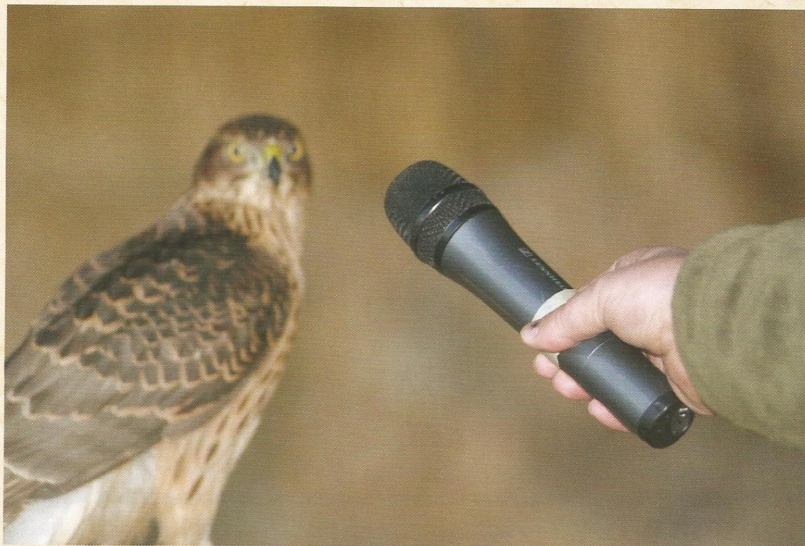
Falconry has many positive messages to society